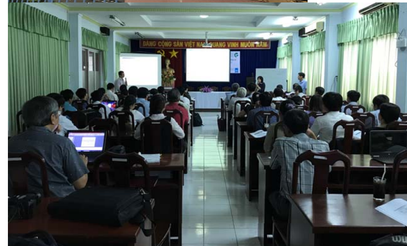
Lectures at Health Service