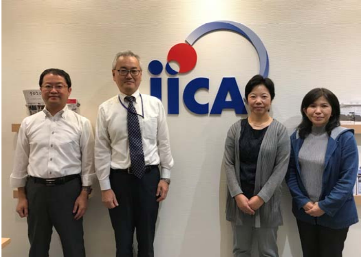
Report meeting at JICA